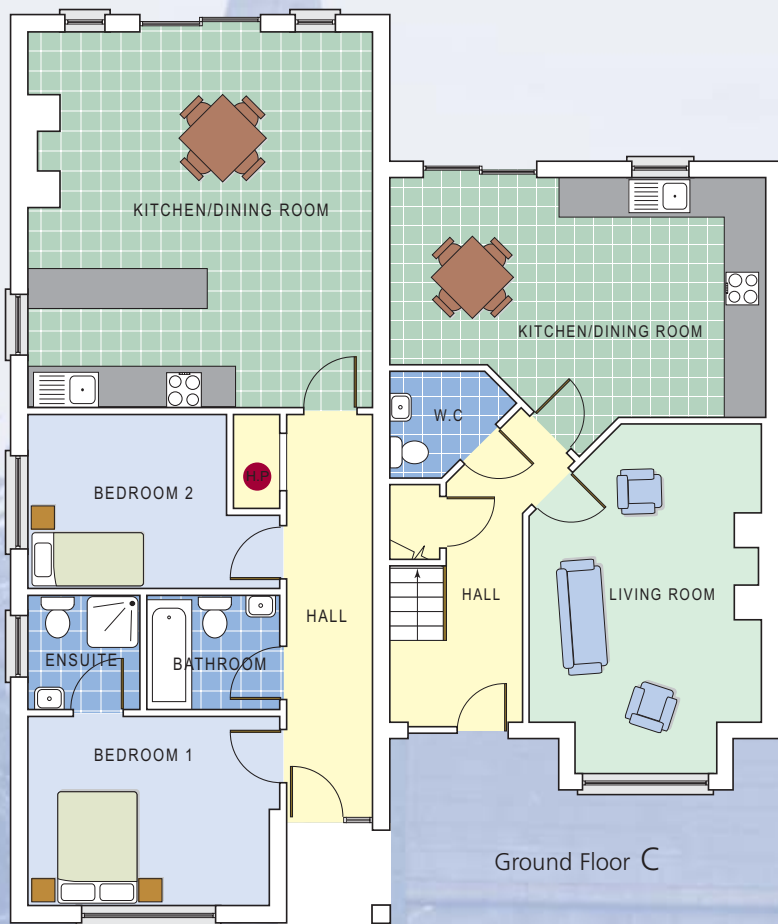
Ground Floor A